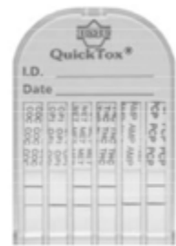
Invalid for OPI, AMP

When no band appears in the CONTROL (C) region, the test is invalid, even if there is a band in the test region. Check test procedures and samples, and repeat test with new device.