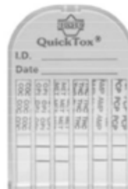
Positive for COC, THC

A colored band in the CONTROL (C) region should be observed. When no colored band is at the specific TEST region, the test is presumptive positive for that particular drug.