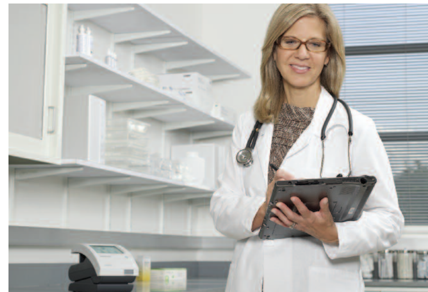
Receive urinalysis results from offsite physician's office.

Connecting to data managers provides visibility to urinalysis testing in decentralized sites