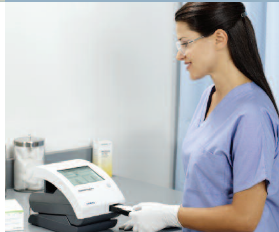
Receive hCG pregnancy tests from emergency department.