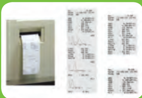
Your Choice of Print Format

w x h x d [inches]/[lbs] 16.5" x 19" x 14" / 62 lbs.