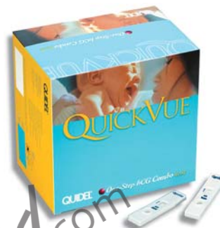
50 Test Combo Kit