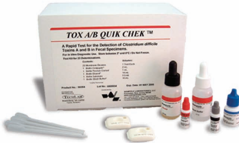
Cat. #30394, 25-test kit

A rapid IVD test for detecting C.difficile toxins A and B in fecal specimens