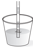
Dip to line, 5 seconds