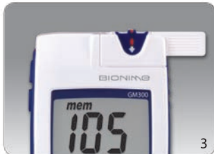
Rapidly- results less than 8 seconds