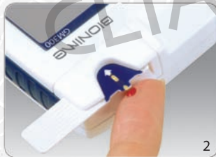
Less pain-1.4µL blood sample only, automatically drawn in