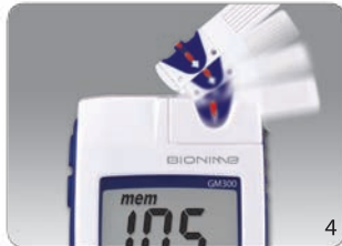
Safety- Keep from touching blood sample

Distributed by: CLIAwaived.com™ San Diego, CA 92121 tel 858-481-5031 toll free 888-882-7739 www.cliawaived.com