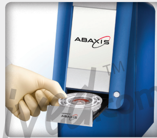
2 / Insert disc