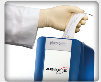
3 / Read results